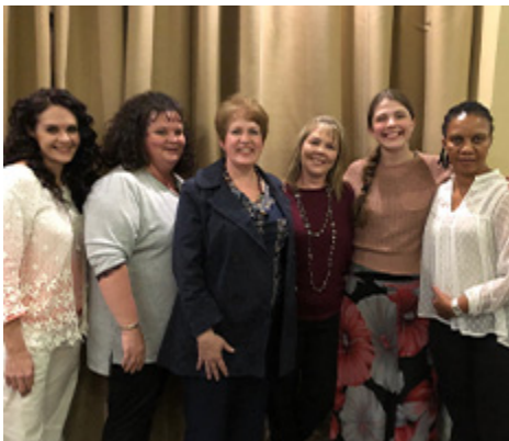
MCHNLA Africa participants at the second workshop in April 2019.

The Tau Lambda at-Large Chapter — in collaboration with AfrIPEN, WHO-FIC Africa Region and Amref International University — will host the 2018-19 MCHNLA Africa poster presentation and cohort graduation at the 2nd Interprofessional Education & Collaborative Practice for Africa Conference on 30 July – 2 August 2019 in Nairobi, Kenya, Africa.